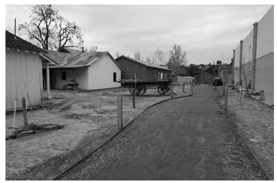
Jan. 2016 – Back Wolf Store and Cookhouse, approaching completion.