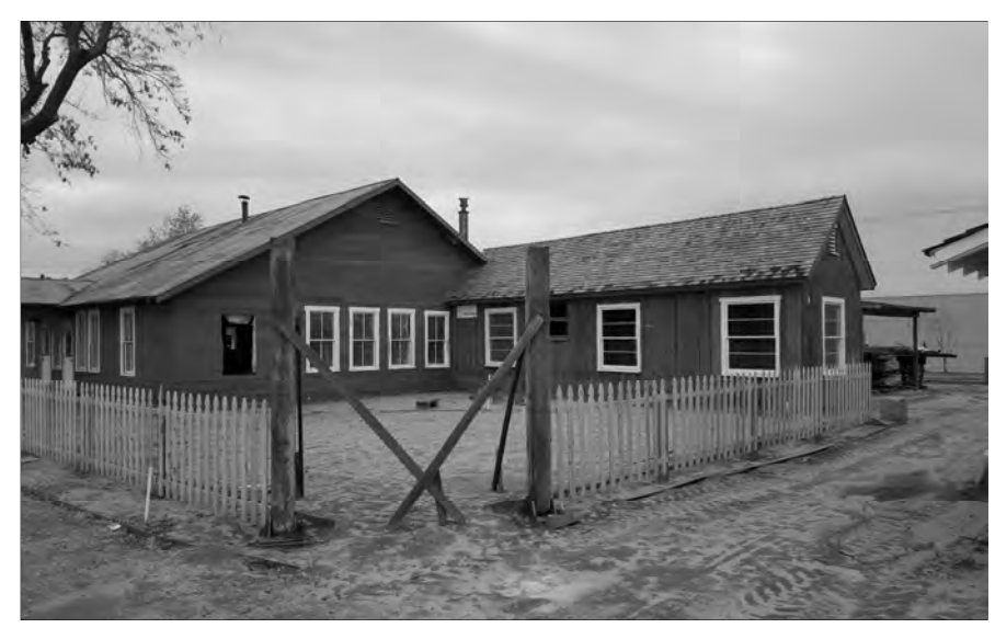
Jan. 2016 - Front corner of cookhouse.

Sincere thanks to all of you who have waited, watched and hoped with us through the years when our dreams for the property had just begun. It looks like those dreams are coming true!