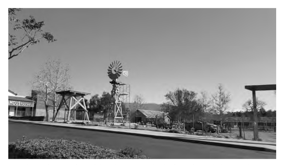
View of new windmill and water tank platform installed recently.