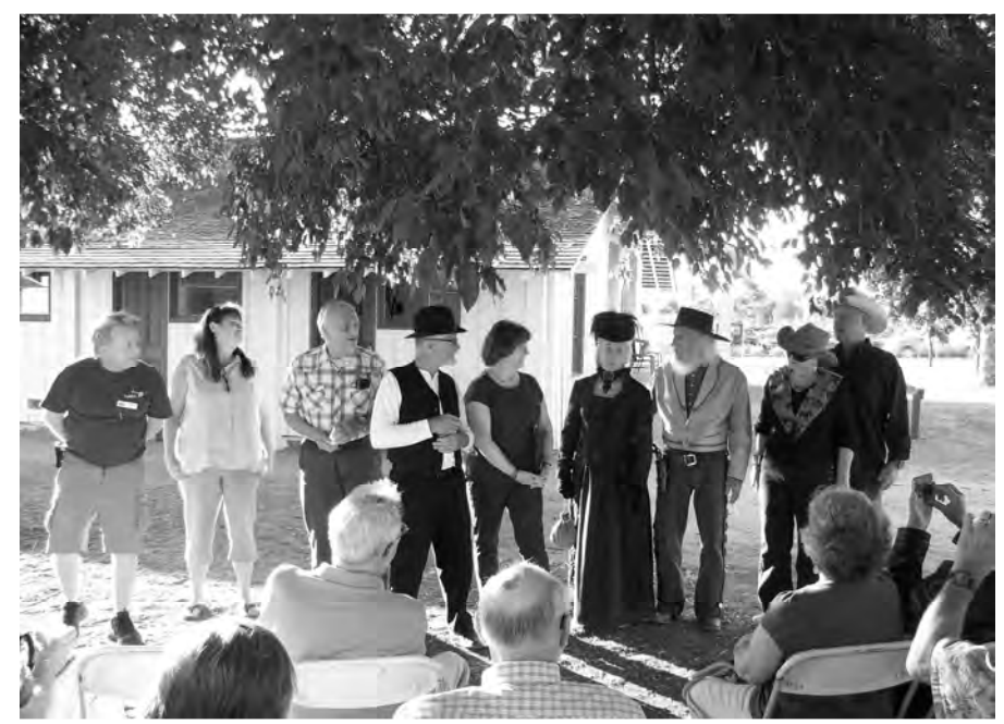
VaRRA Board at Special Meeting of the Temecula Valley Historical Society sharing the news about the restoration of the Wolf Store. Attendees were also given a tour.