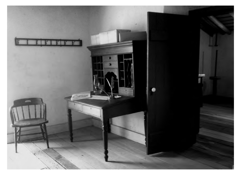
An interior view of one of the rooms at the Warner-Carrillo house described below.

Newsletter from the Vail Ranch Restoration Association Copyright 2013, Temecula, California