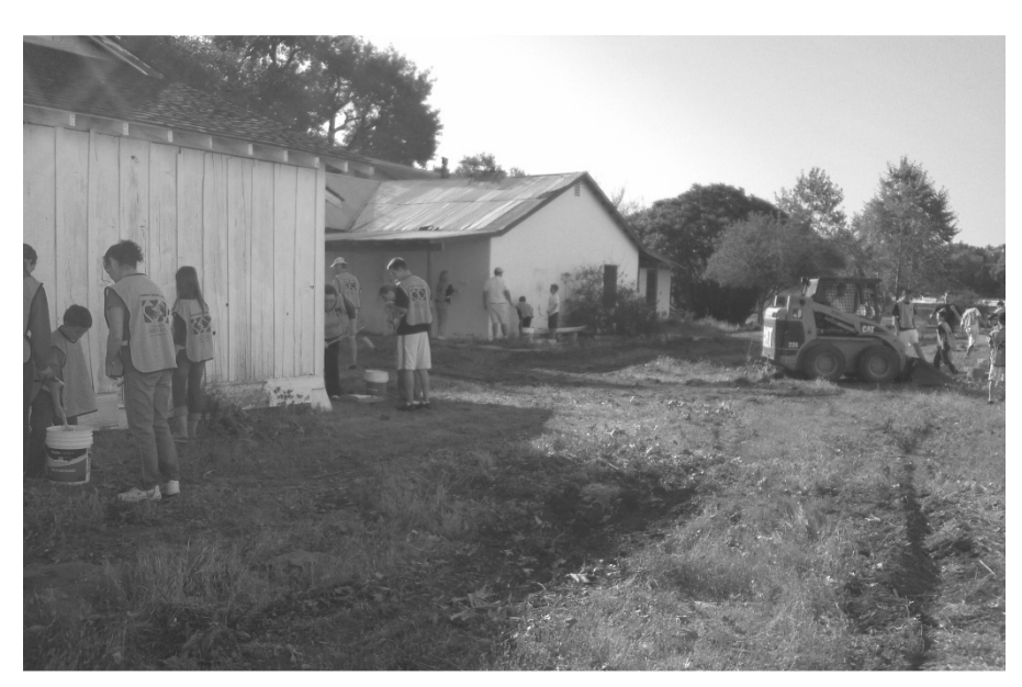
Photo behind the Wolf Store and Cook House with crews busy painting, and others moving large objects out of the way, as well as helping to grade the grounds. Motorized equipment was a big help.