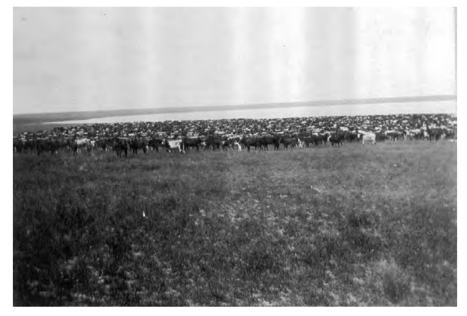
Photo taken at the beginning of the Desert Cattle Drive led by Edward Vail. Railroads had raised their rates for shipping of cattle, and the drive west was to seek & verify alternative ways to move herds.

VaRRA News 1<sup>st</sup> Qtr. 2011 Page 3