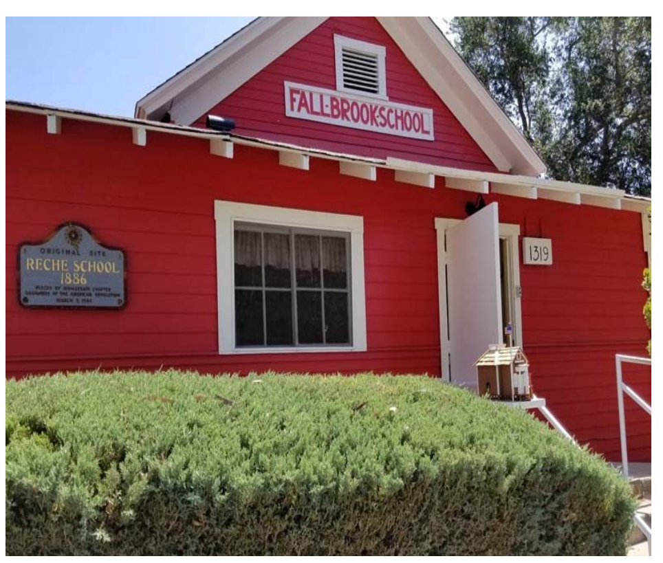
The Reche School established in Fallbrook 1886