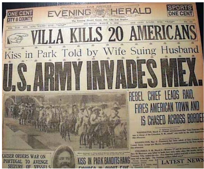
March 2, 1916 Edition of L.A. Evening Herald

zations. The 143<sup>rd</sup> Field Artillery Regiment was a combat arms regiment of the California Army National Guard that served during the 1916 Mexican Border Campaign, also known as the U.S. Army Punitive Expedition.