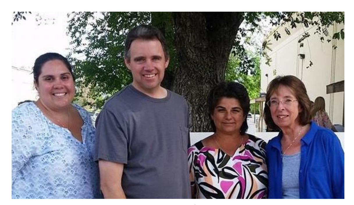
Murrieta Valley Historical Society's executive board members.