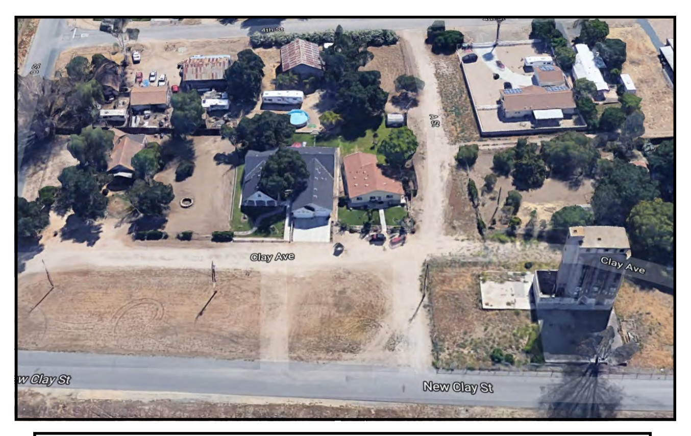
The Ainsworth & Fallis General Store was located at the intersection of Clay and A Street. The two houses on the green lawns marks the location of the store. The ring to the left is the fountain remnants of the Fountain House Hotel. The grain elevator is to the northeast of the identified property. New Clay Street was the railroad path.

South America. They believed they would be gone for six months, but the business deal fell through and the men returned home.