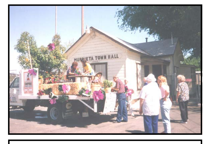
In 1997, club members prepare their float in front of the original town hall preparing to participate in the 50th Anniversary of the Murrieta Volunteer Fire Department Parade