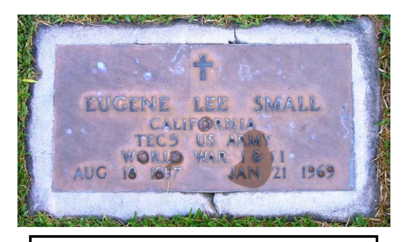
Eugene Small's grave marker at the Laurel Cemetery in Murrieta, CA.