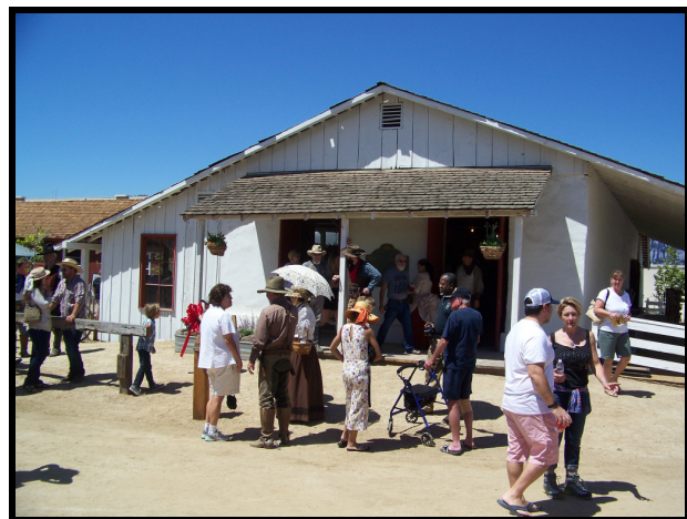
The Wolf Store

On July 19 th the Murrieta Valley Historical Society launched its membership drive. I immediately broke out my checkbook and became a member. I want to encourage you to join the Society and together we can make history come alive for future generations.