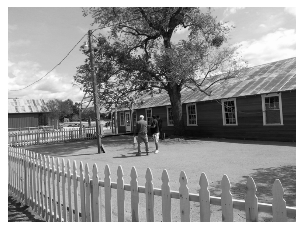
Picket fences are modeled after the old Vail Ranch fences, and will outline outdoor activity areas.