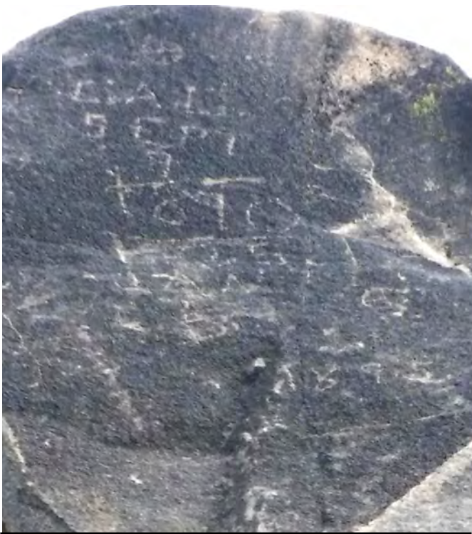
An etching from Los Alamos Heritage rock