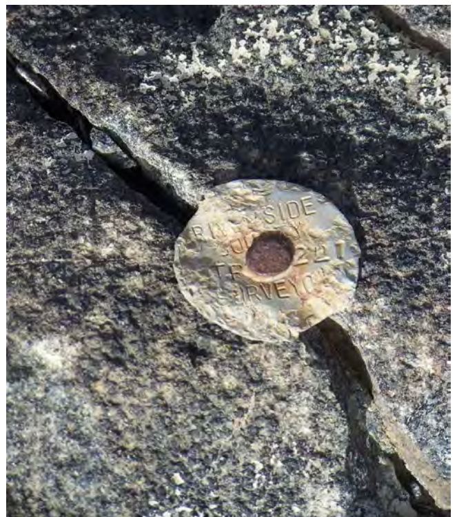
A U.S. Geological Survey marker from the rock.